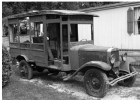
1931 mail truck awaits restoration in the KCHS Pole Barn

If you'd like to volunteer to work on the Hesperus between February and August, 2012 (during museum hours), please contact me for information on an introductory training session: curator@kitsaphistory.org.