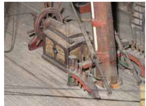
Detail of Edgar Jameson's model, Hesperus , slated for renovation as part of the exhibit, Arts & Crafts .