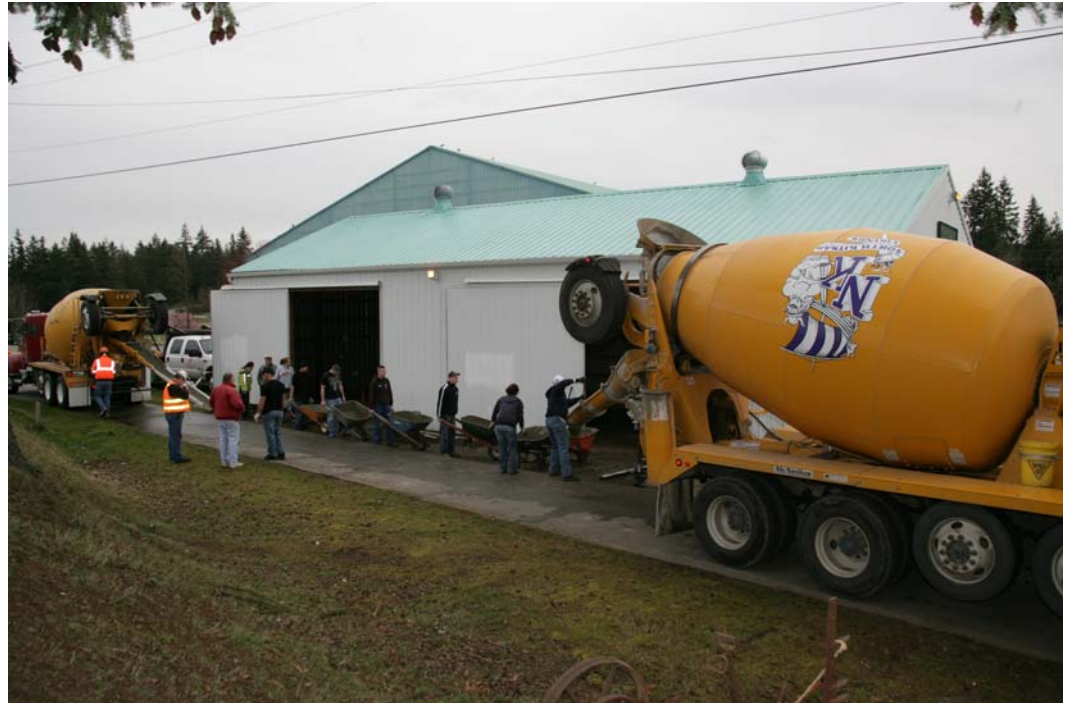
Navy personnel wheel concrete into the Pole Barn from Fred Hill Materials trucks

Each year our Museum opens our “Pole Barn” for viewing during the Kitsap County Fair. Over the past 30 years we have accumulated quite a large collection of artifacts pertaining to early logging, agricultural, and rural history. Although the artifacts have been stored on platforms above the dirt floor, we have long desired to improve preservation by installing a concrete floor. On March 25 th , our goal was accomplished. This was truly a community effort with several businesses, organizations, and individuals donating time, equipment, and materials to make it happen. We are grateful for all of the donations.