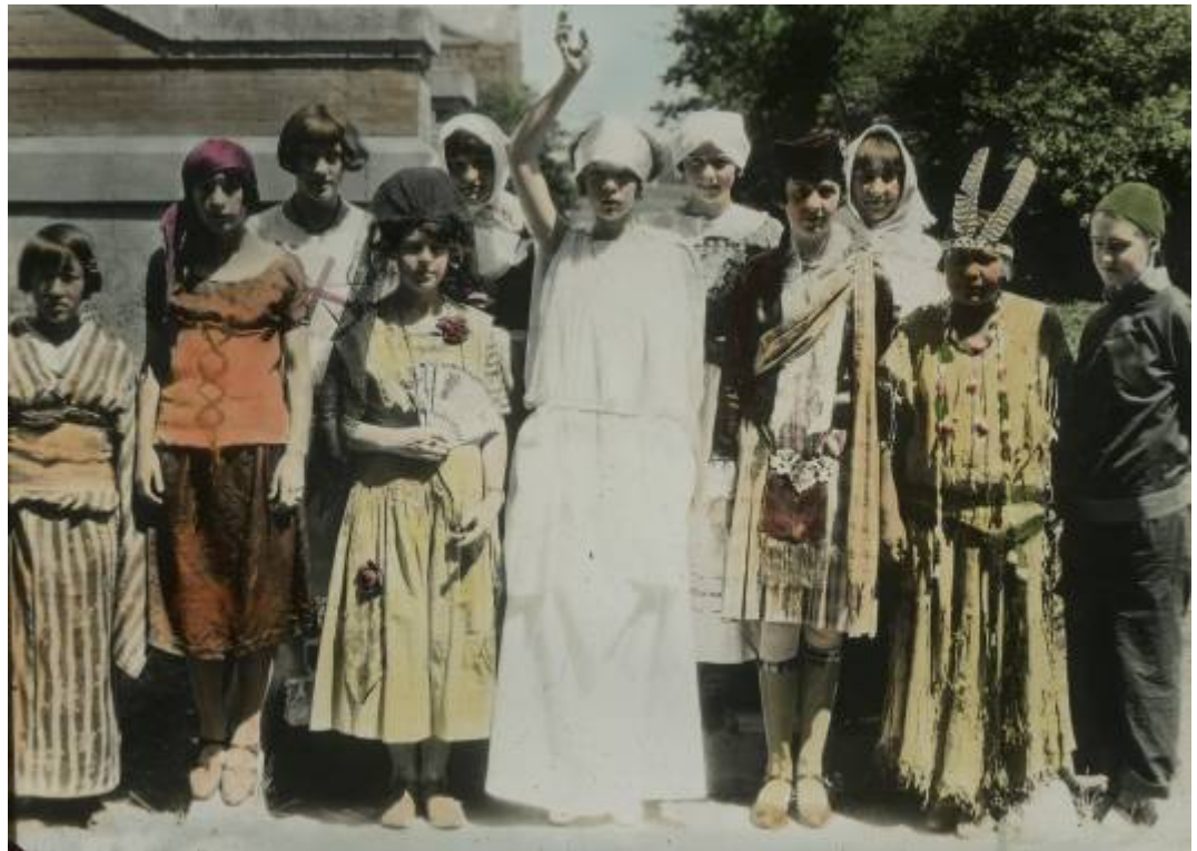
4h State Club Camp prior to 1936, "The Melting Pot".