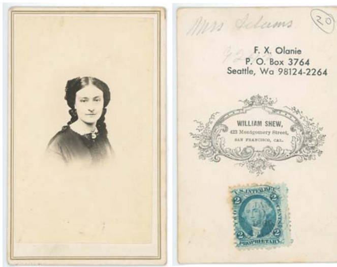
Cassandra Adams Photo, KCHS Collection, Gift of Mrs. F.X. Olanie

style: small albumen prints, 2½by 4 inches, mounted on cardboard stock and produced during the period 1860 -1900. They were most popular during 1859-1866 and, during a brief period in the Civil War, were required to have a special "revenue" stamp on the back. Because of their small size several prints were combined on one large photographic plate, keeping their cost reasonable. For this