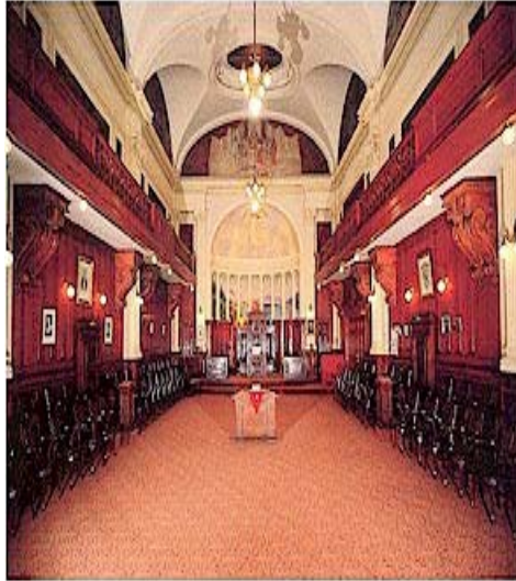
Temple of the Knights of Pythias Hall, Tacoma