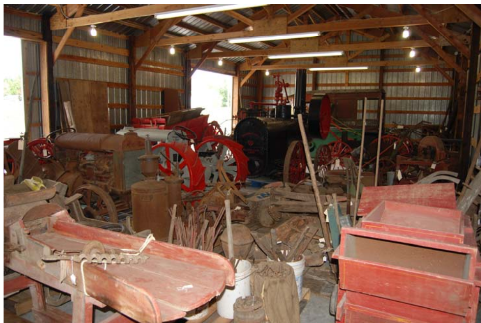
Pole Barn, June 2008

We're also planning a few surprises. Be sure to stop at the Pole Barn and see what's been going on. See you at the Fair!